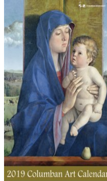
2019 Columban Art Calendar

The 2019 Columban Catholic Calendar, Christmas Cards and other gifts are now available in the St Vincent De Paul Piety Stall in the front of the Church.