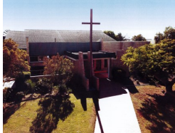
Parish of Our Lady & St Dympna 1928 - 2018