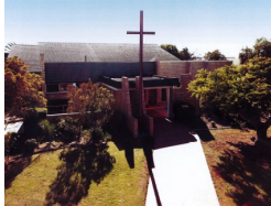
Parish of Our Lady & St Dympna 1928 - 2018

God Bless Fathers On Earth and In Heaven! Happy Father's Day!